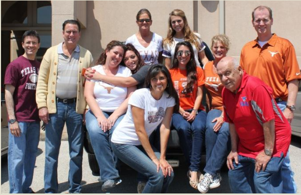
College Football Day