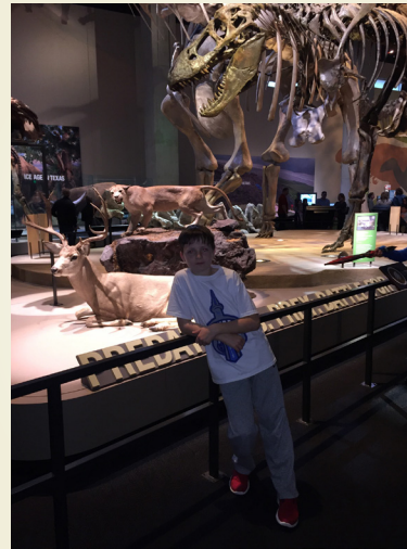
The Perot Museum