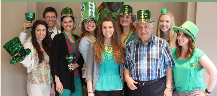
St. Patrick's Day