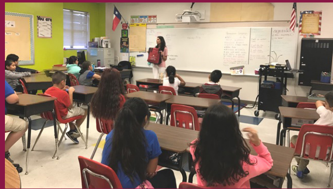
St. Anne Elementary Career Day