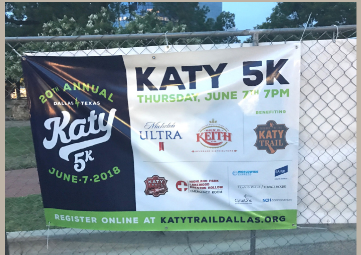
The 20th Annual Katy Trail 5k